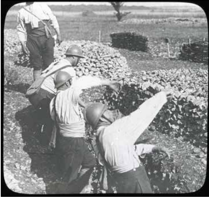
Grenade training lantern slide: Soldiers received a variety of weapons and artillery training, including how to throw grenades. The World War I Training Slides Collection captures training practices at American military camps.